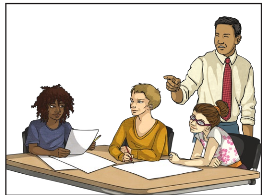
"Quiet class!" exclaimed the teacher.